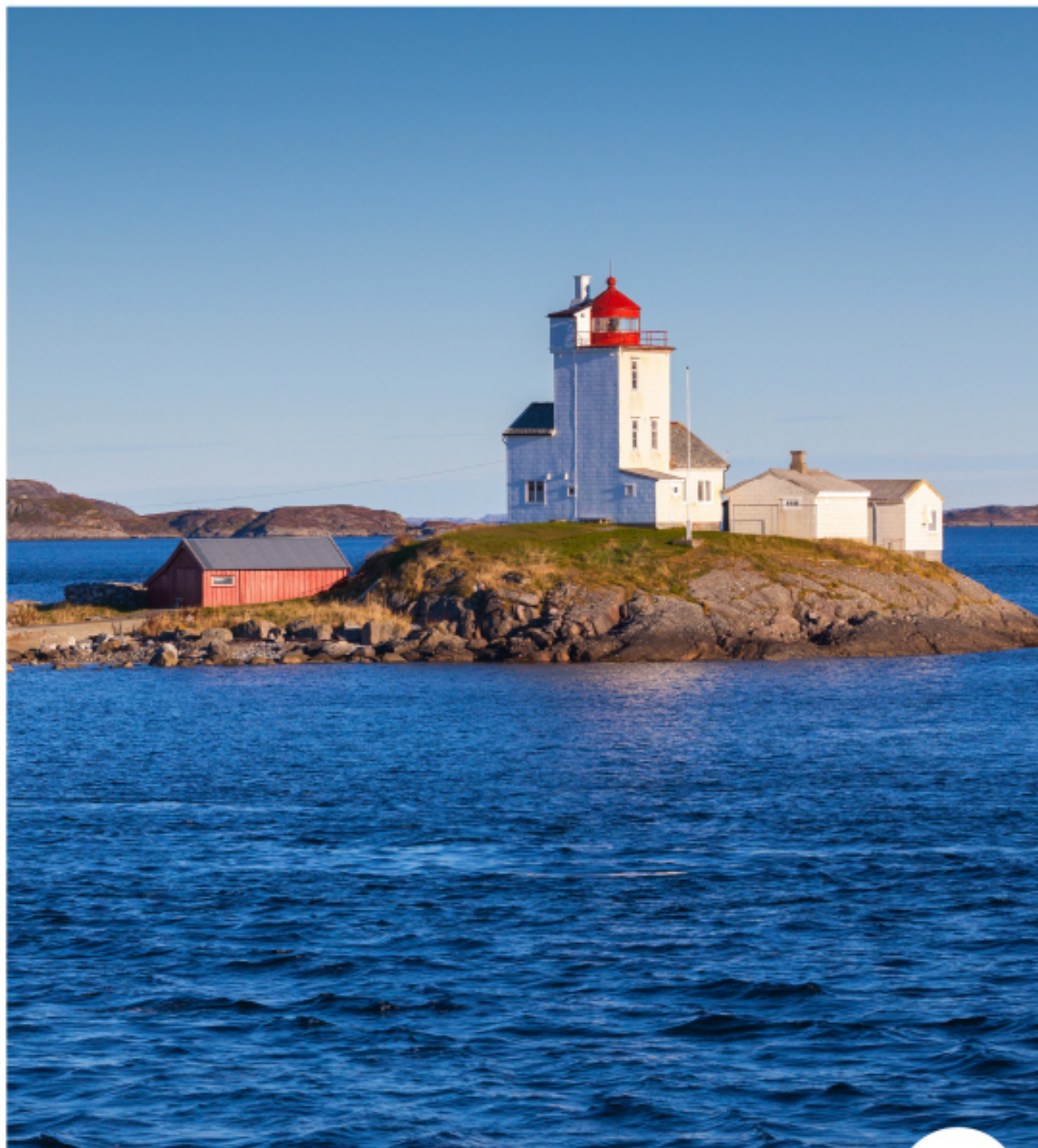
Tyrhaug fyr, Smøla